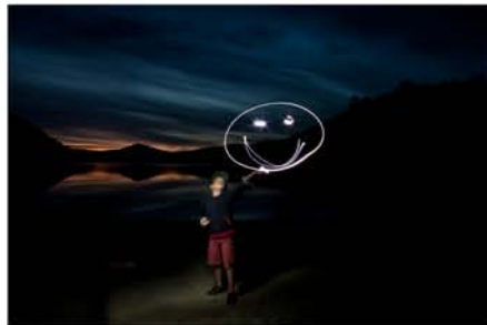
Light painting workshop inspire smiles, small and large